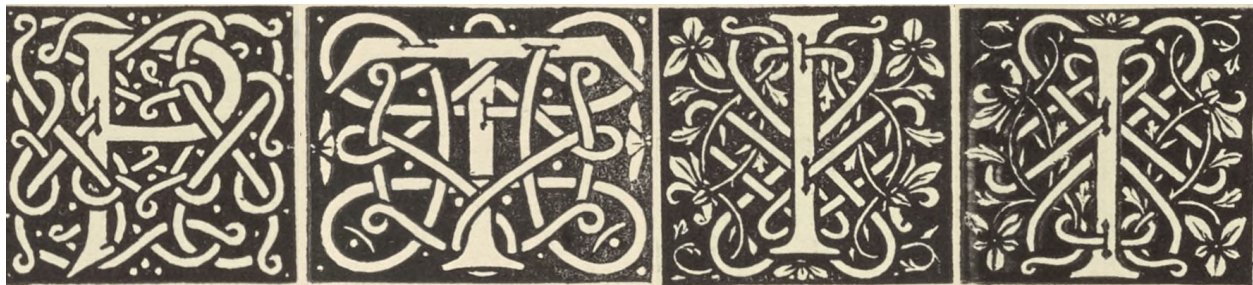
Figure 1. Decorated Initial Letters in the Dial No. 5 (1897)

In December 1897, Charles Ricketts and Charles Shannon brought out the fifth and final number of The Dial: An Occasional Publication . Like the previous issue of the preceding year, the last Dial was published by the Vale Press and printed at Ballantyne's under Ricketts's supervision, in a run of 270 copies priced at 12 shillings 6 pence apiece. Reverting to a layout not used since the second volume, the contents page was located at the back, rather than the front, of the magazine. Although the number of contents was roughly the same as in earlier issues—ten images, eight pieces of literature, and four decorative initials—the prose and poetry tended to be shorter, so the folio only came to 28 pages, rather than the usual 36. Consistent with Ricketts's page design in each of the five volumes, only the prose pieces in the magazine were decorated: the interlaced white initials, some with flowers and stems, were printed on a black ground (fig. 1; see also Database of Ornament ). The capital "I" was used twice, but inverted the second time, giving it a slightly different appearance. Ricketts embellished the knotwork and