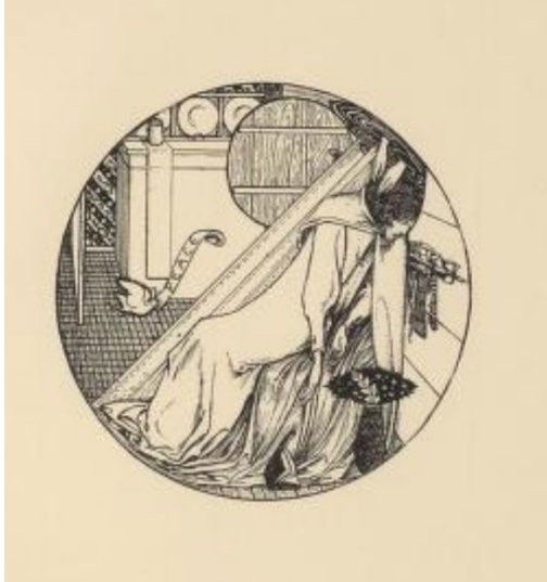
Figure 3. Charles Ricketts, Reproduced Pen Drawing. “The Vision of King James the First of Scotland,” Dial No. 5 (1897)

proposed edition that did not transpire. Ricketts’s biographer, J.G.P. Delaney rightly observes that these illustrations “are in his best Art Nouveau style and have that marvelous sense of design and decorative effect at which he excelled” (98). In the “Vision” illustration Ricketts uses the round frame of the image for decorative and emotional effect, repeating the shape in the ship’s porthole, through which angelic hands and radiant light reach down to the entranced King.