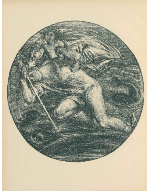
Figure 2. Charles Shannon, lithograph, “The Infancy of Bacchus,” Dial No. 5 (1897)

strapwork around this letter with the violet and viola, a floral device that Ricketts was proud to have introduced with his Vale Press (Ricketts, Defense 109).