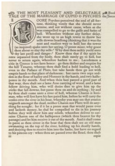
Figure 4. Charles Ricketts, Vale Type and Initial, Dial No. 4 (1896)

the art contents, thus making their point that typography and wood-engraved ornament are as worthy of study for their beauty as other art forms (fig. 4). Inserted within the Dial 's folio format, Ricketts's Vale Press specimen booklet is distinctive, as it is folded to quarto size and printed on a thicker paper, watermarked "Unbleached Arnold (Ruskin)" (Watry 40). Paradoxically, the Vale Press insert in the Dial is both commercial advertisement and visual art. The specimen pages of Vale type, like the Dial itself, attest to Ricketts's belief that "a work of art is a whole in which each portion is exquisite in itself yet co-ordinate" (Ricketts, Introduction, 120).