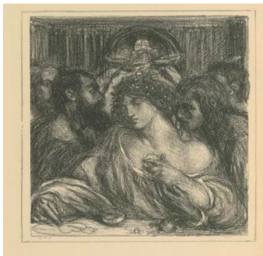
Figure 2. Charles Shannon, “Delia.” Lithograph, The Dial , No. 4 (1896)