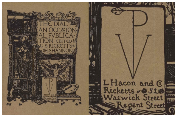
Figure 1. Front Cover of The Dial , No. 4 (1896), with enlarged logo of the Vale Press

few and far between, they were always dazzling when they arrived ( “The Dial,” Saturday ).