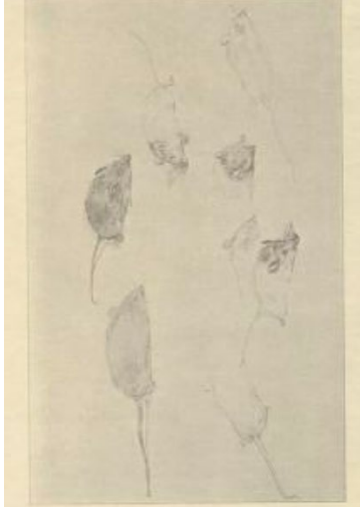
Figure 5. Charles Shannon, "A Study of Mice," Silverpoint Drawing, The Dial No. 4 (1896)