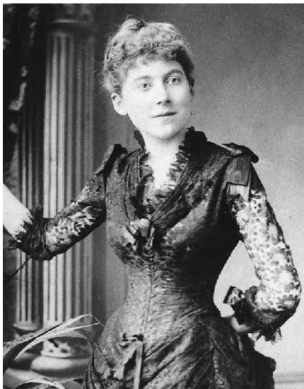
Mabel Dearmer. Photograph.