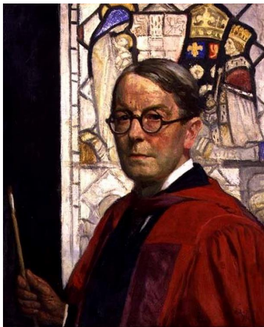
Robert Anning Bell. A self-portrait of Anning Bell as Master of the Art Workers' Guild, 1921. Oil Painting, 1922.