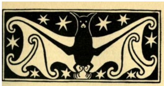
Figure 2. Headpiece for "Cobweb Hall," p. 43