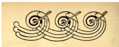
Figure 3. Headpiece for the Table of Contents, p. 6

The literary contents of the Autumn number were more balanced between fiction and non-fiction than had been the case in the Spring volume. However, the four fictional pieces were not in the modern short story genre promoted by The Yellow Book . Three were adaptations of traditional folktales, and one was a personal reflection. Sir George Douglas’s “ Cobweb Hall ” relays a Berwickshire story about a butler who murders his mistress. A Celtic-inspired but boldly modern and unconventional headpiece featuring a bat with outspread wings introduces this gruesome tale that, according to the author, circulated in broadside in the Scottish Borders (51). As a Baronet hailing from the Scottish Borders himself, Douglas no doubt gained extra authenticity for his legend with the magazine’s readership. The story’s placement in the Autumn in Life section connects with its thematic concern with individual death. Edith Wingate Rinder’s retelling of Paul Féval’s Breton legend, “ Amel and Penhor ,” links the Autumn in the World section to the Evergreen ’s Pan-Celtic vision. Located in Autumn in the North, Fiona Macleod ’s version of the traditional Irish legend, “ Mary of the Gael ,” which is interspersed with Gaelic verses, is by far the longest item in the number (24 pages). For the same section, Macleod’s correspondent, writer and journalist John Macleay contributed “ The Breath of the Snow ,” a personal reflection on the changes in weather, personality, and community that autumn brings.