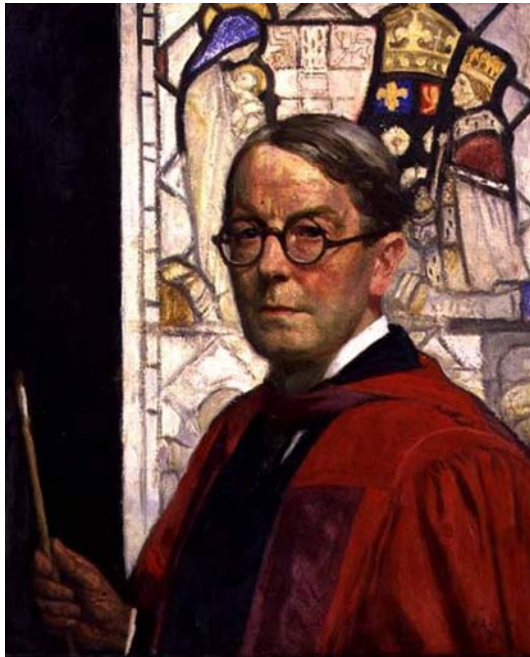
Bell, Robert Anning. Self portrait as Master of the Art Workers' Guild . 1921-22. Oil painting. The Art Workers' Guild, Queen Square, London.

Robert Anning Bell was a versatile decorative artist who worked as an illustrator between 1889 and 1912. In 1879 he entered the Westminster School of Art, under the directorship of Professor Fred Brown (1851-1941). He moved to the Royal Academy Schools in 1881, studying in Paris for a year at the Académie Julian and at the studio of the painter Aimé Morot (1850-1913) before completing his studies at the RA Schools in 1887. In 1891 he traveled to Italy, where he was greatly influenced by the paintings of Bellini and other Italian Renaissance artists, as well as by the early illustrated books produced in Venice and Florence.